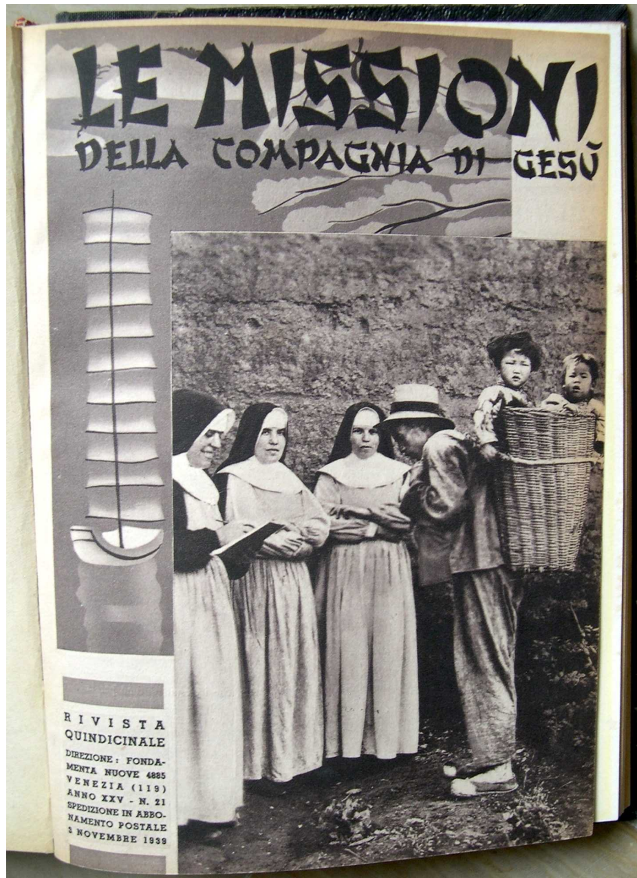
fig. 1. Front page of the Journal "Missions", November 3, 1939.